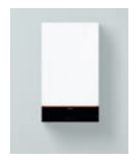
Vitodens 100-W (B1HF und B1KF)