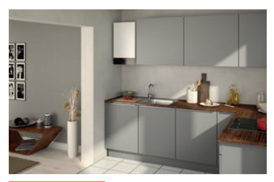
₩ H<sub>2</sub> READY · 20%