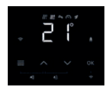
LCD touchscreen display