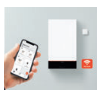
Use the ViCare app to conveniently operate the heating system and save energy - at any time, from anywhere.

Additionally, connecting a ViCare Thermostat to the boiler using its WiFi interface means that not only can even more comfort and efficiency be enjoyed, but importantly no third party controls are required and everything is contained in a single Viessmann ecosystem.